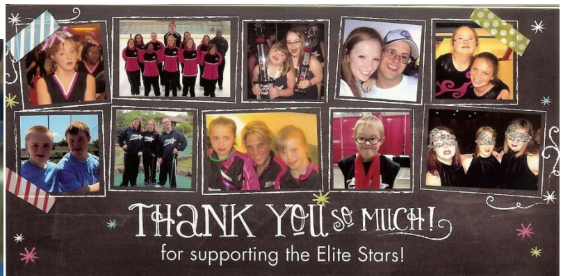
Thanking Everyone Again!