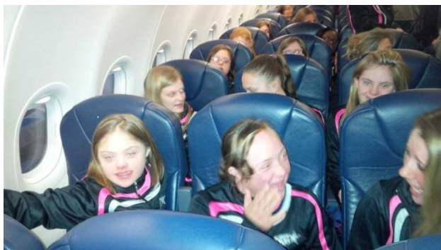
The Elite Stars On their way to Myrtle Beach

" It's official!!!! The Elite Stars are the 2015 National Cheer Champions!!! New banner, trophy & coats on the way. Love my team!!! We fought hard for what was right & in the end the Varsity brand knew it was the only thing to do.